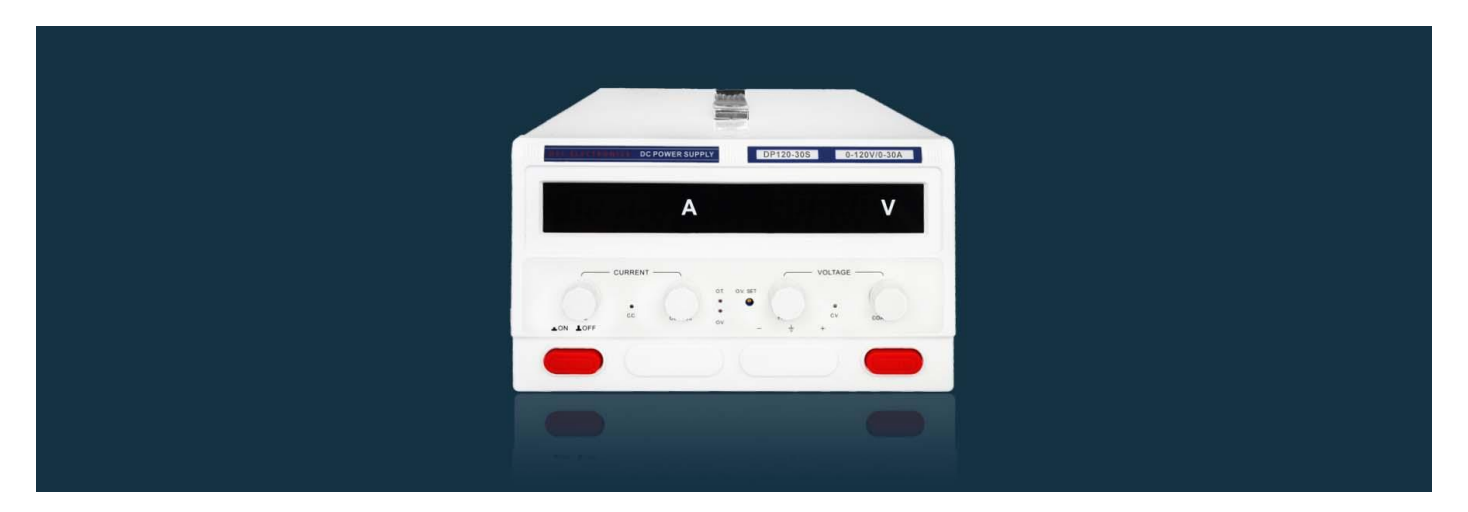
Fig.1: DP-S Series Power Supply (DP120-30S)